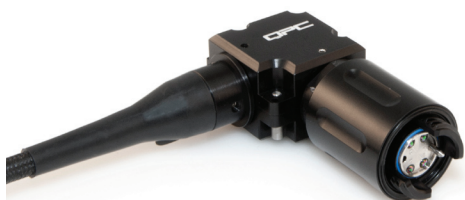
Qmini 90° Quick Connect Connector (pictured without dust cover)